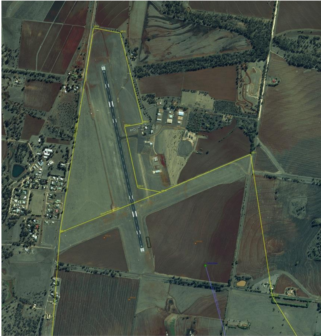
Figure 2 - The scrutineering course.